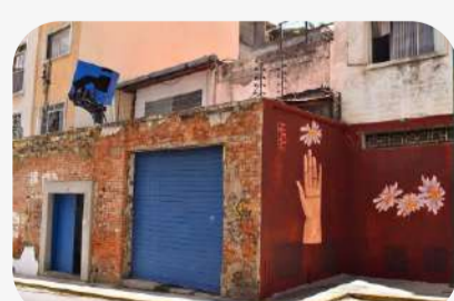
Illustration at Instituto de Diseño de Caracas